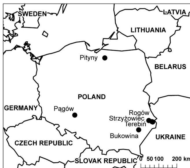
Figure 1. Locations of field experiments.

In 2017–2019, eight field experiments with maize for grain were conducted: four in 2017 (Pağów, Pityny, Rogów, and Strzyżowiec), 2 in 2018 (Rogów and Terebiń), and two in 2019 (Bukowina and Rogów) (Figure 1). The experiments were conducted on following soils: Pağów–Albic Podzols (sandy loam: clay–10%, sand–55%, silt–35%); Bukowina (loam: clay–20%, sand–35%, silt–45%), Pityny (sandy loam: clay–12%, sand–64%, silt–24%), Rogów (silty clay loam: clay–29%, sand–20%, silt–51%), Strzyżowiec (loam: clay–26%, sand–30%, silt–44%) and Terebiń (clay loam: clay–27%, sand–26%, silt–47%)–Endocalcaric Cambisol [27].